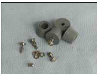
KW661610 - FOOT (PACK 4)