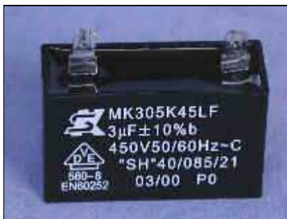
KW661490 - MOTOR CAPACITOR