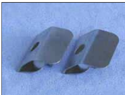
KW661593 - BREAD PAN LOCATION CLIPS (PACK 2)