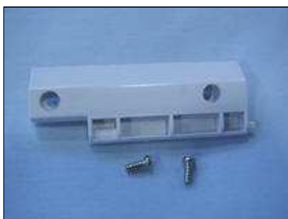
LID HINGE & SCREWS

KW661555 - WHITE BM200 KW665264 - GREY BM258