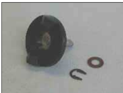
KW661531 - DRIVE DOG ASSEMBLY