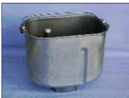
KW661567 - BREAD PAN