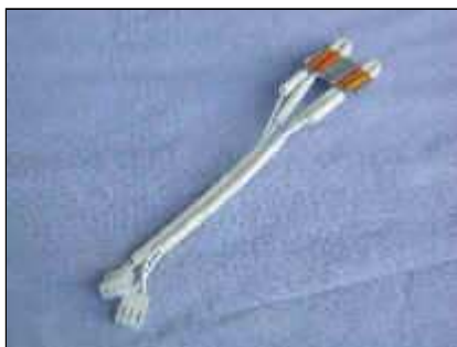
KW661517 - TWIN THERMAL FUSE ASSEMBLY