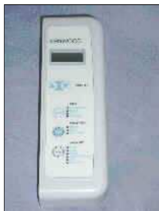
CONTROL PANEL ASSEMBLY COMPLETE WITH PCB, inc. THERMIS Date code up to 3K32

KW661660 - WHITE BM200 KW665290 - STAINLESS STEEL BM258