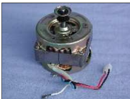
KW661464 - MOTOR ASSEMBLY COMPLETE