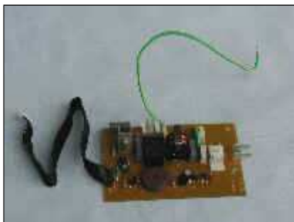
KW661476 - MAIN PCB