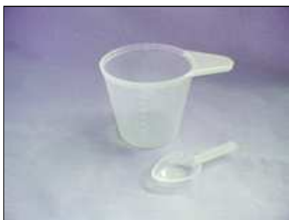
KW664193 - MEASURING SPOON & CUP