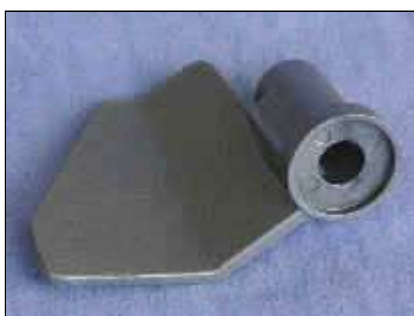
KW661579 - KNEADER