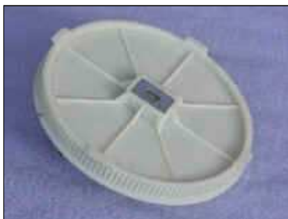
KW661529 - LARGE PULLEY