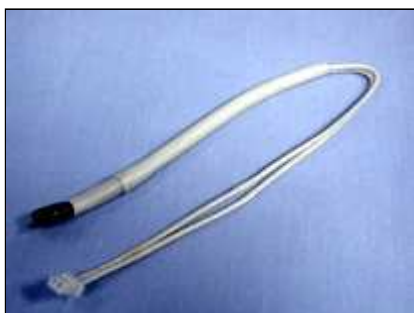
KW665850 - THERMISTOR ASSEMBLY