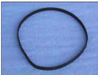
KW661505 - DRIVE BELT